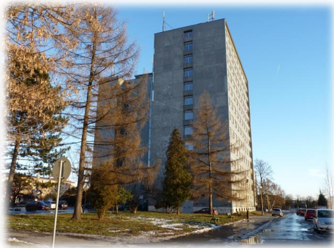
Halls of Residence